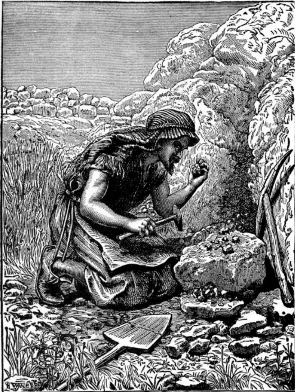
THE TREASURE HID IN A FIELD.